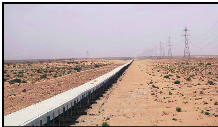
The Moroccan conveyor belt for phosphates from the occupied Western Sahara is more than 100 km long and thereby the world's longest.

ALL COUNTRIES HAVE A RESPONSIBILITY The international community and individual countries have a responsibility to resolve the conflict in Western Sahara and to protect the rights of the refugees. As the High Commissioner for Human Rights states, the international community must take all necessary steps to ensure that the right to self-determination is respected. Common Article 1 of ICCPR and ICESCR oblige all member states to promote the realisation of the right to self-determination and respect that right, in accordance with the provisions of the UN Charter. 51 Since the obligations we have dealt with, are peremptory norms and apply erga omnes (that is, in relation to all ; not just between parties), all states must do what is in their power to make the parties respect them. According to the Articles on State Responsibility, individual states have a duty of