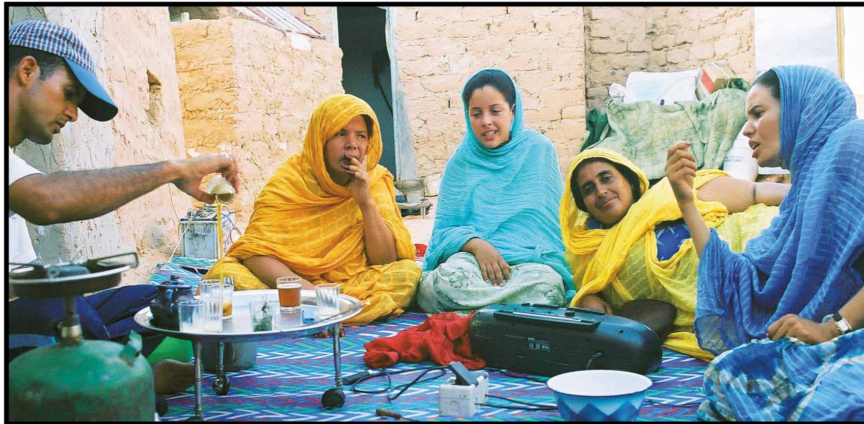
The tea ritual is important in the Sahrawis' culture and their daily lives.

INSISTENCE ON INTEGRATION The Sahrawis have been promised a referendum which will decide their own future. Over 100 UN resolutions and the International Court of Justice in The Hague