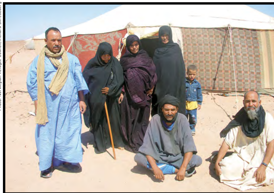
A small number of Sahrawi nomads still live in the Polisario controlled areas of Western Sahara.

REFUGEES The humanitarian situation of the refugees in particular is becoming more and more precarious. The ICESCR has special arrangements allowing developing countries to prioritise their own citizens to a certain degree, but the 1951 Refugee Convention contains some minimum social and economic standards for refugees. Algeria, as an asylum country, must meet its obligations according to the basic human rights conventions and the 1951 Refugee Convention, to which it is a party. Member states of human rights conventions are under an obligation to respect and promote the rights of all people within their territory, including refugees and asylum seekers. Algeria, however, is of the view that they have no responsibility for the refugees, due to the fact that they are organised by a government in exile, SADR, led by Polisario. Algeria's stance has no support