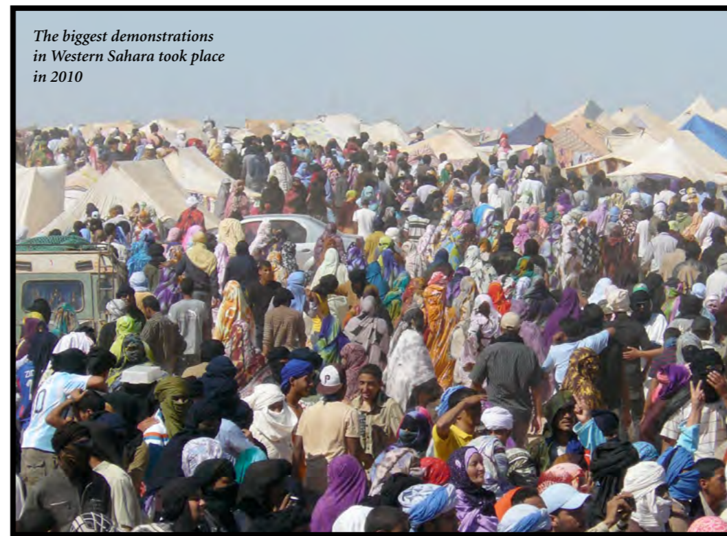
The biggest demonstrations in Western Sahara took place in 2010

Several oil companies are still active in the oil exploration in Western Sahara, the most heavily involved being French oil company Total – in violation of the UN legal opinion. 25 ■