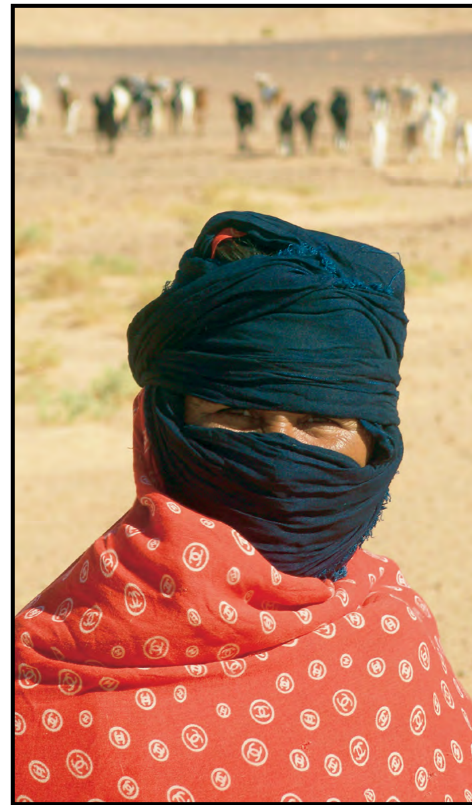
Camel and goat herding forms the basis of the livelihood of the Sahrawi nomads.