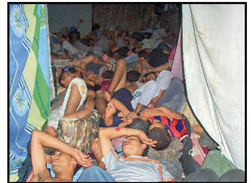
The UN Special Rapporteur on Torture described in 2013 the poor conditions in Moroccan jails. Here from the main prison in the Western Sahara capital.

In addition to violations by the authorities,