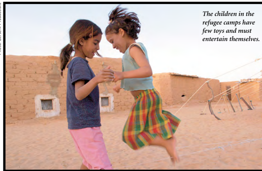
The children in the refugee camps have few toys and must entertain themselves.

parts of the world. The refugees themselves take care of aid distribution, and are in charge of all administration, education and health services.