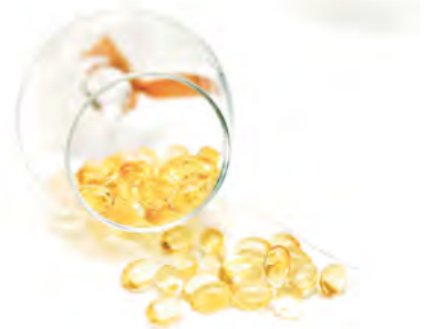
Fish oil from Western Sahara end up in Omega 3 capsules all over the world.

In addition, hundreds of shipping companies transport fish and phosphate to the international market. Morocco's illegal export of phosphate brings in an income of around hundreds of millions of US dollars every year 21 . In recent years, the phosphate exported from Western Sahara has an estimated value of around 400 million US dollars – or more than ten times what the international community donates through multilateral humanitarian aid to the refugees annually.